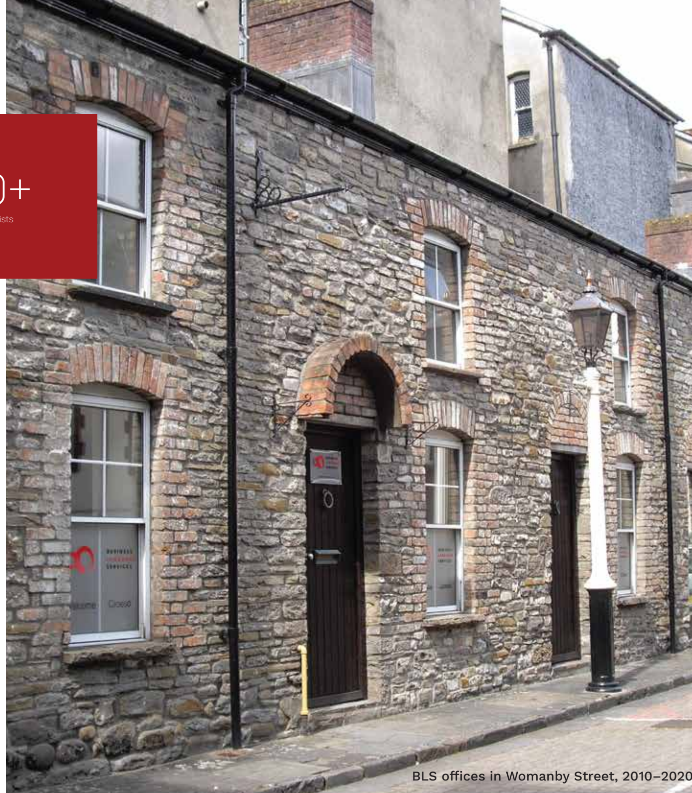
BLS offices in Womanby Street, 2010–2020

2024 saw the opening of our office in Glasgow, supporting our ambitious expansion plans to better serve our clients the length and breadth of the UK.